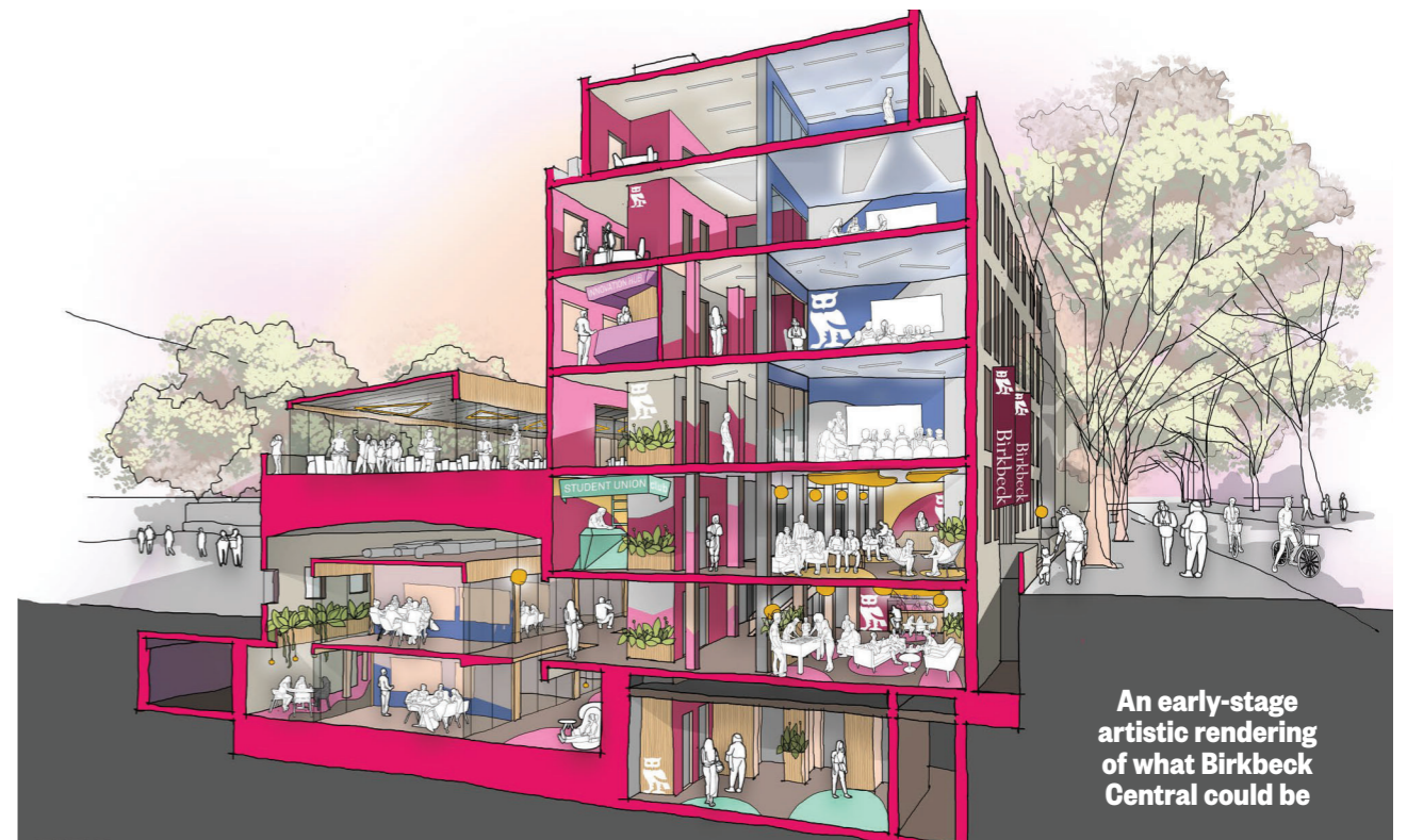
An early-stage artistic rendering of what Birkbeck Central could be

The world's first facility dedicated to studying brain development in toddlers has welcomed children and their families to take part in pioneering new research. The building houses cutting-edge wireless and virtual environment technology, which has been adapted