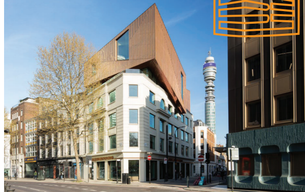
373 EUSTON ROAD